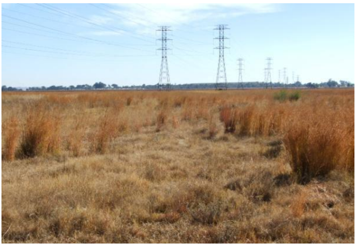
Figure 5: Existing power lines