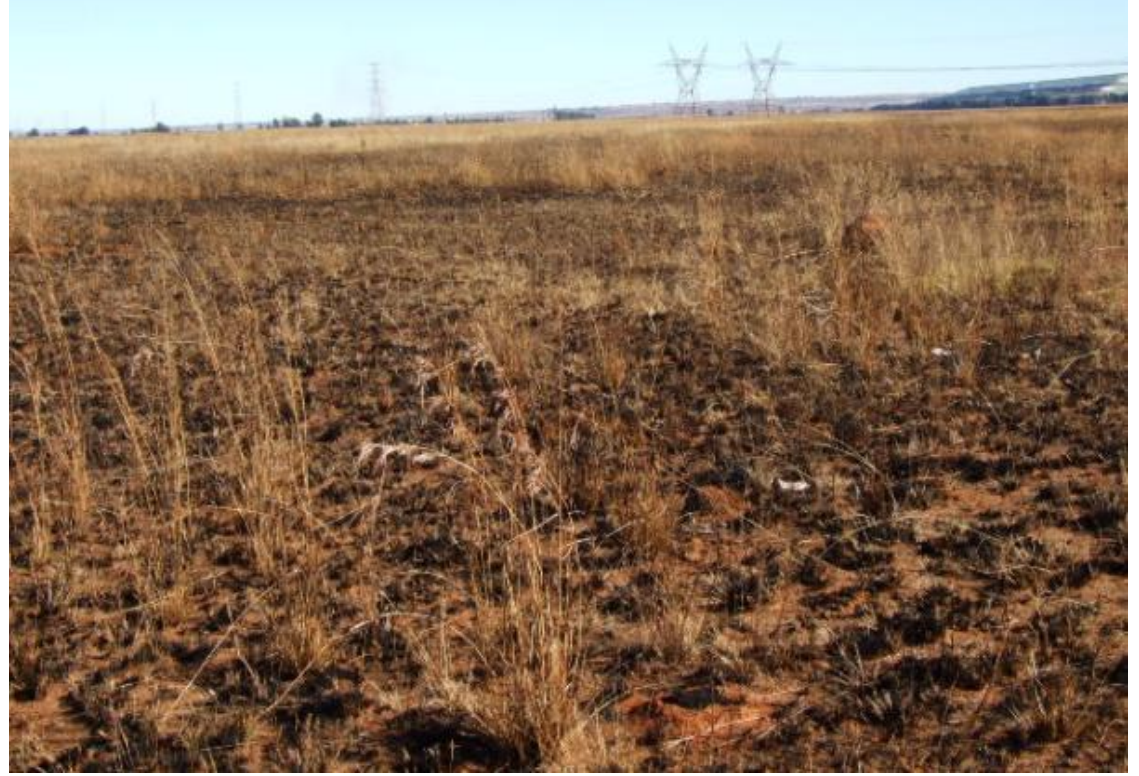
Figure 2: Old lands