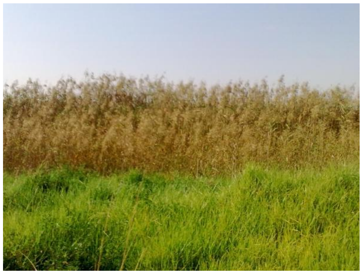
Figure 8: Wetland