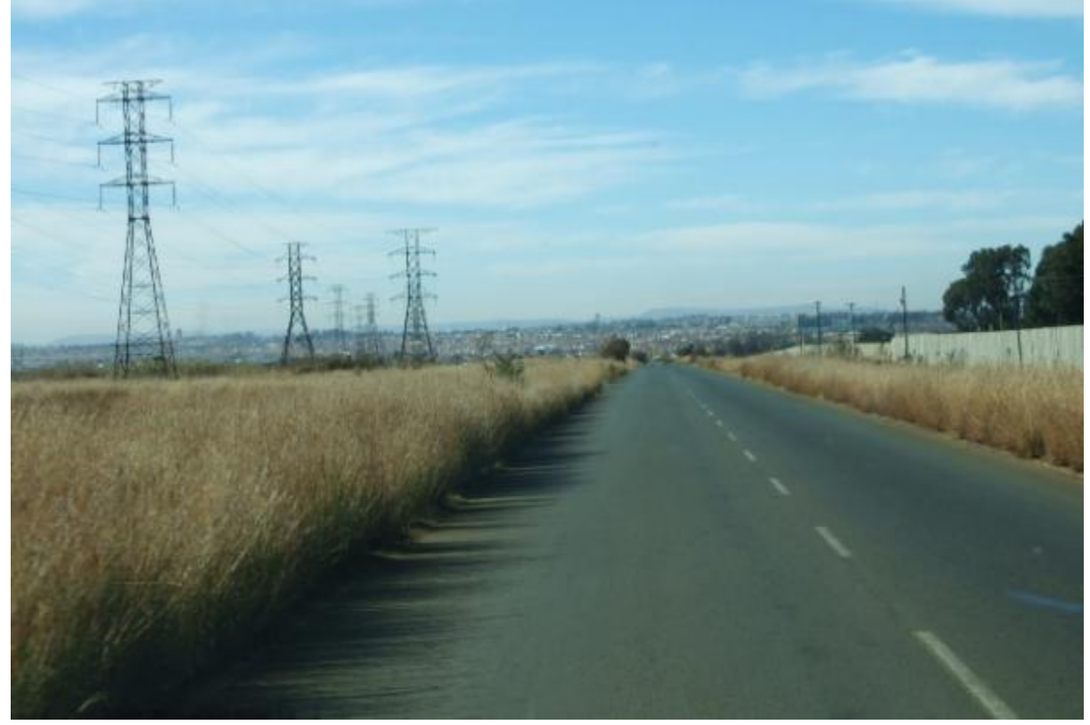
Figure 6: Urban areas