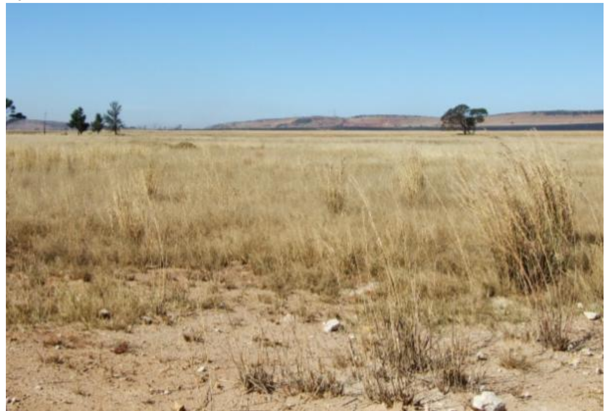
Figure 8: Natural grassland