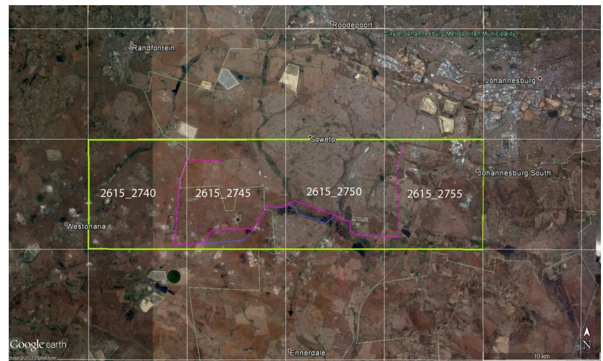
Figure 2: The block of 4 SABAP2 pentads within which the study area is located.

Bird distribution data of the South African Bird Atlas 2 (SABAP 2) was obtained from the Animal Demography Unit of the University of Cape Town (ADU 2015), as a means to ascertain which species occurs within the four pentads where the study area is situated, namely 2615_2740, 2615_2745, 2615_2750, 2615_2755. A pentad grid cell covers 5 minutes of latitude by 5 minutes of longitude (5'× 5'). Each pentad is approximately 8 × 7.6 km. Between 2007 and 2015, a total of 106 full protocol cards (i.e. 35 bird surveys lasting a minimum of two hours or more each) have been completed for this area (see Figure 2 below).