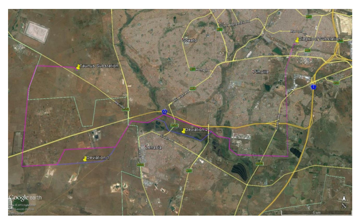
Figure 1: Proposed alignments for Taunus – Diepkloof 132kV. The purple line represents the proposed alignment and the blue sections the alternative alignments.

Figure 1 below shows the study area with the proposed alignments.