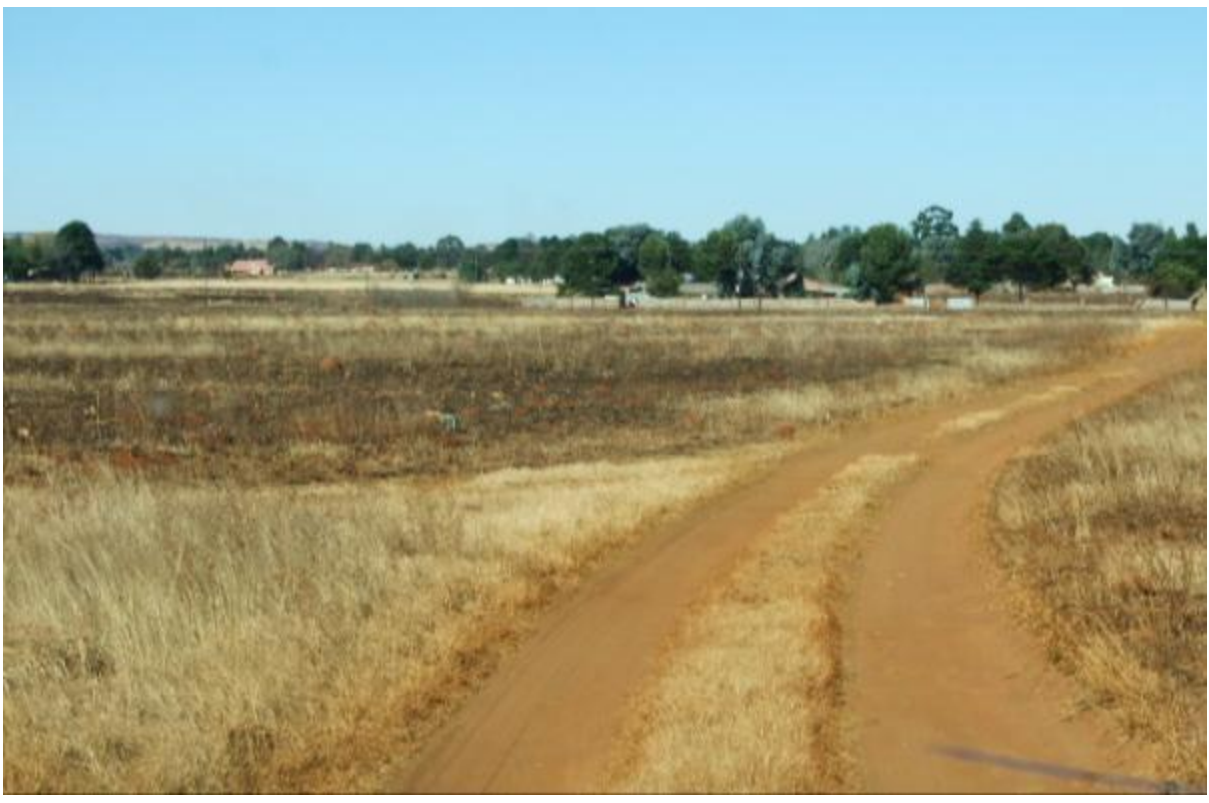
Figure 7: Urban areas