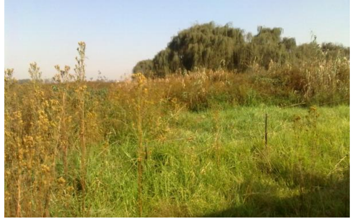
Figure 9: Wetland