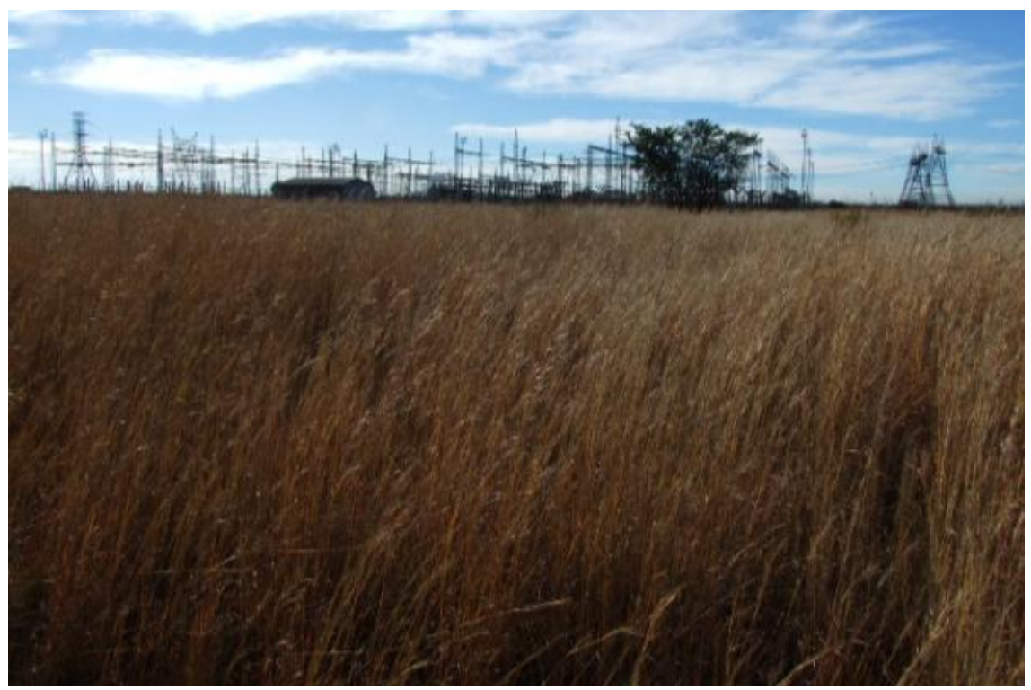
Figure 1: Taunus Substation