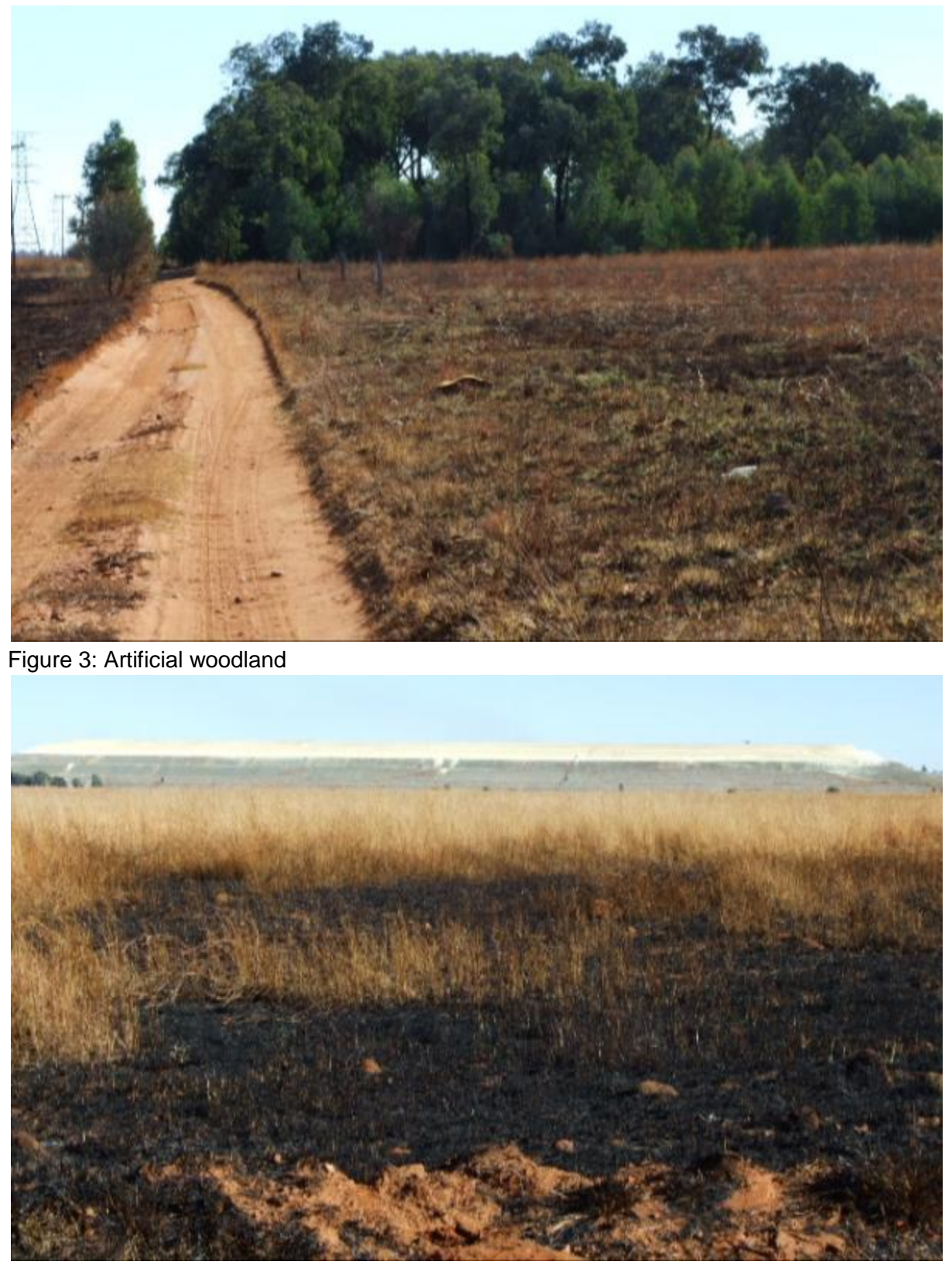
Figure 4: Mining

Updated Bird Impact Assessment Report: Proposed Taunus – Diepkloof 132kV